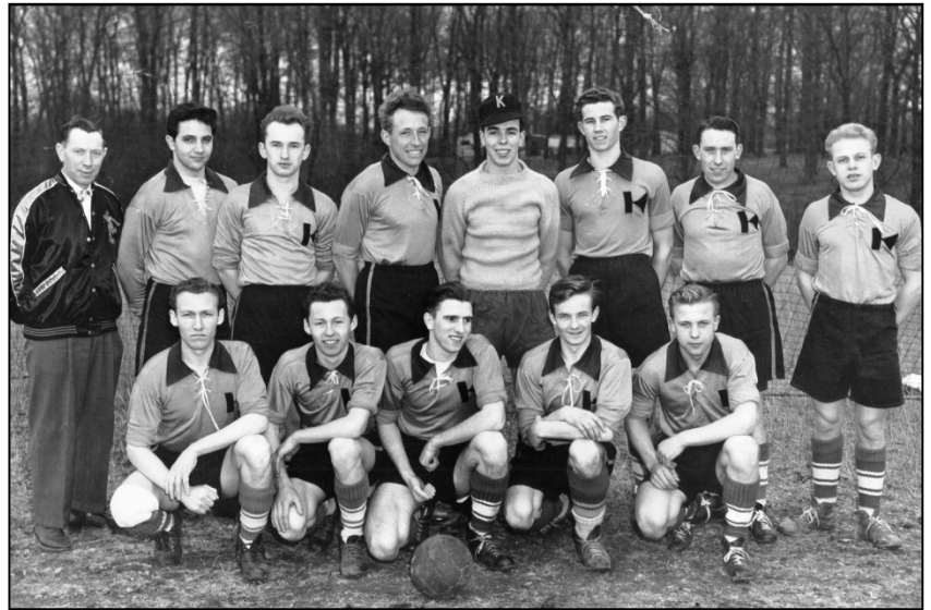
1952 Kolping Soccer Team