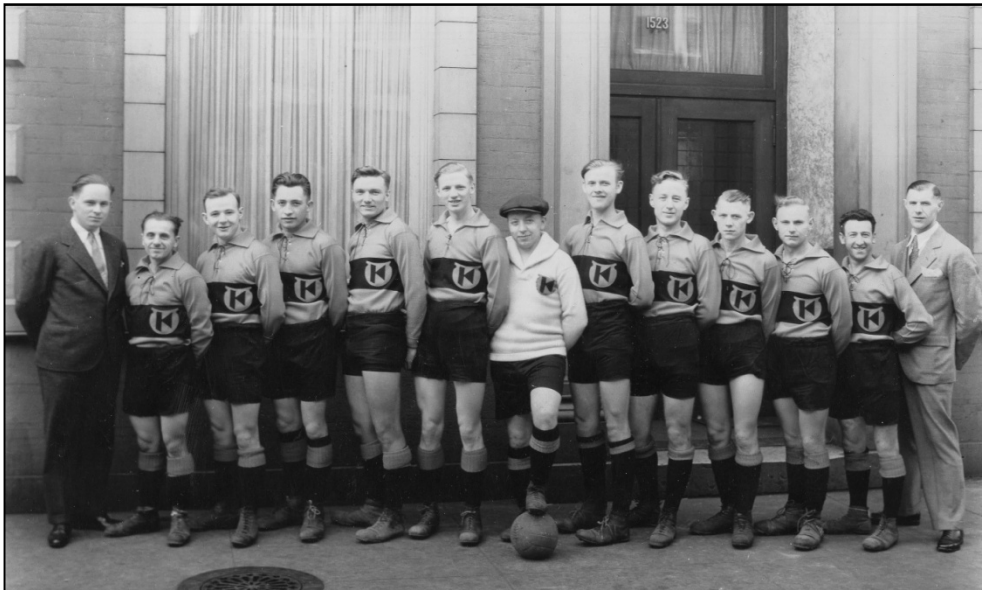
The Kolping Soccer Team (first team) in 1932.