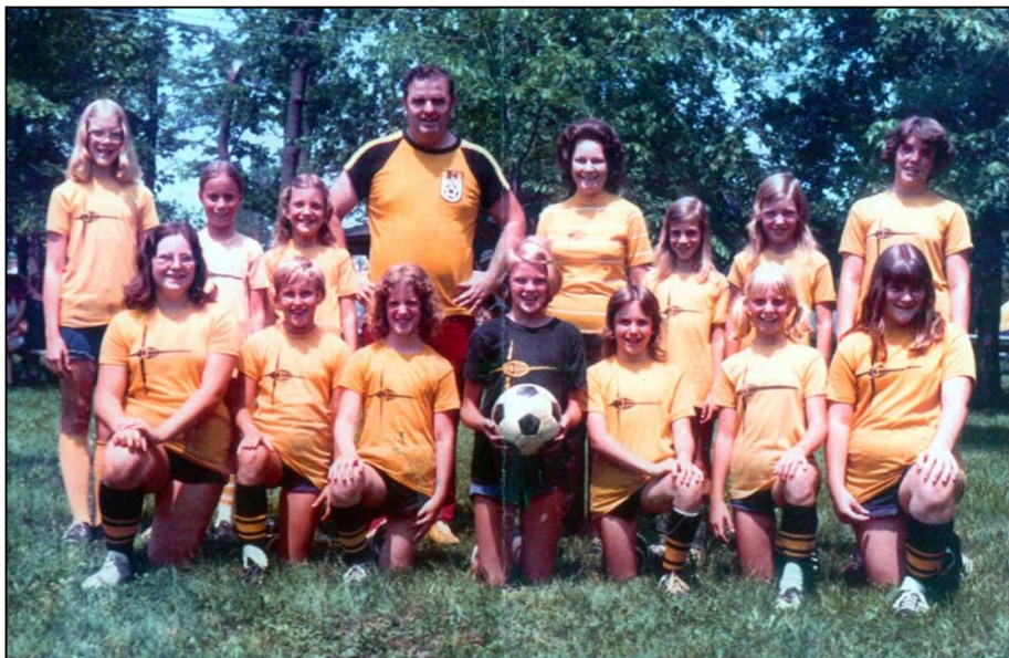
The first Kolping Girls' Soccer Team in 1975