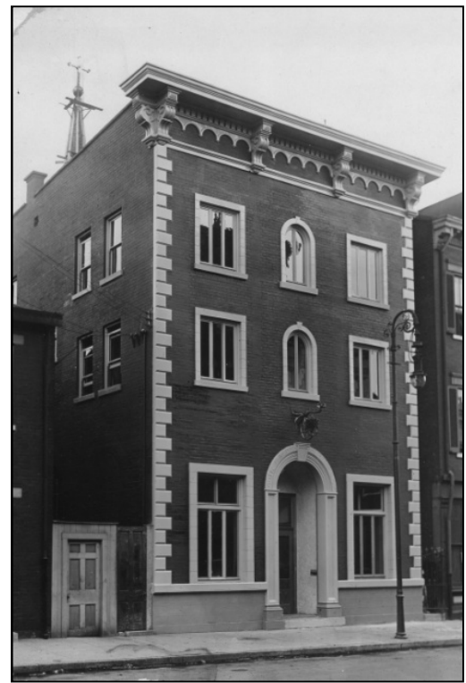
Right, the Kolping House after major renovations in 1930.