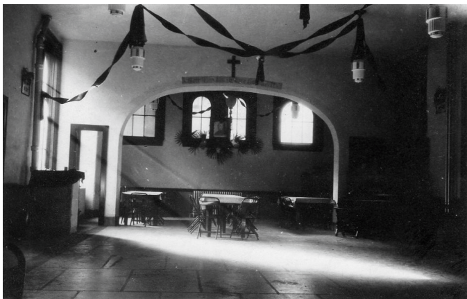
Left, the main hall of the Kolping House in the 1930s.

The building that housed the Cincinnati Kolping Society for so many years still exists today at 1523 Republic Street in the newly refurbished Over-the-Rhine district of Cincinnati. The building was renovated in 2016, and there are now four condos on the upper two floors and a business on the first floor. The Kolping motto, "Gott segne das ehrbare Handwerk" (God bless our honorable work) still shows above the front door.