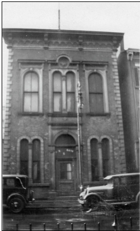
Left, the Kolping House before renovations.