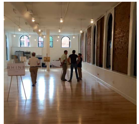
Right, the main hall in August of 2016.