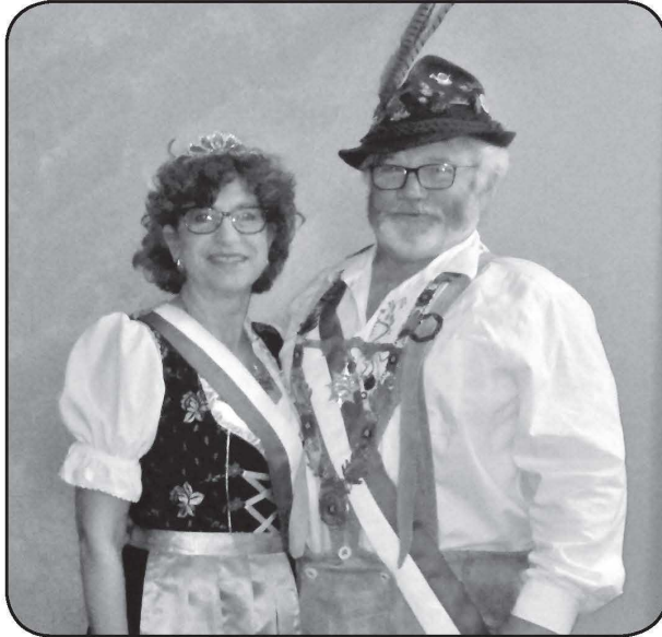
Queen Rose and King Sepp

The 94th Annual CATHOLIC KOLPING SOCIETY'S